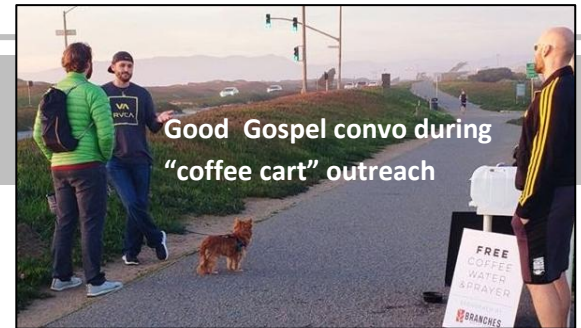
Good Gospel convo during "coffee cart" outreach